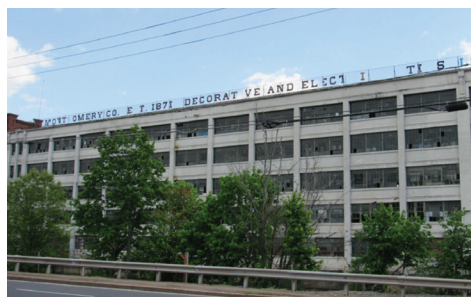
MONTGOMERY MILLS, WINDSOR LOCKS

Montgomery Mills, a 160-unit adaptive reuse of a former mill, is undergoing redevelopment and will help create a transit town center along Main Street.