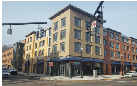
24 COLONY STREET, MERIDEN

Meriden , a key station stop along the CTrail Hartford Line, is an emerging transit center and an early transit-oriented development (TOD) success story. The City's TOD program seeks to transform the half-mile area around it into a vibrant neighborhood that includes new residential and commercial development, public